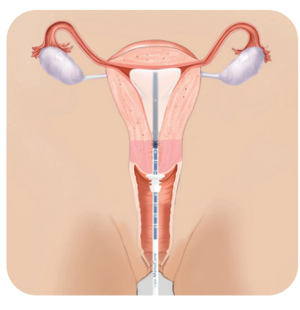
Step 2 - Treatment The balloon is gently inflated with a heated liquid to fill your uterus. The liquid is circulated for ~2 minutes to treat the lining of the uterus.