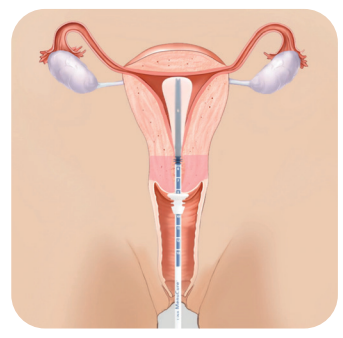
Step 3 - Removal After treatment, the balloon catheter is deflated and removed from the uterus.